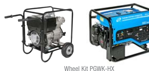
for TPG4 Series Generator & Gas Engine Pumps